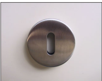
art. INOX010A/52 \varnothing 52