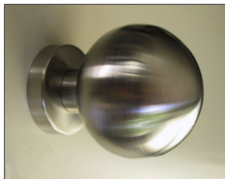
art. INOX69/70 \varnothing 70