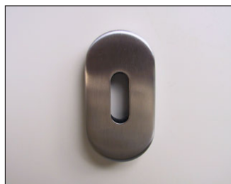
art. INOX010B/60 mm. 62 x 32