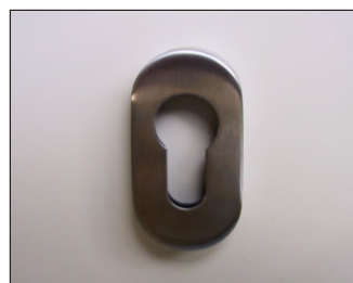
art. INOX011B/60 mm. 62 x 32