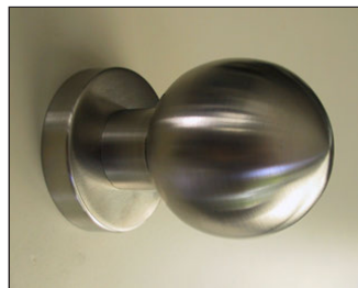
art. INOX69/50 \varnothing 50