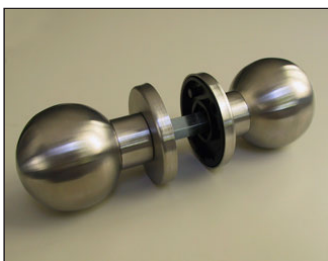
art. INOX00/50 \varnothing 50 couple of revolving knobs

art. INOX01/50 single revolving knob with square spindle (art.015) enclose