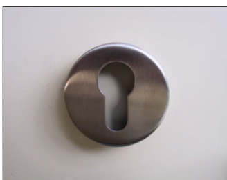
art. INOX011A/52 \varnothing 52