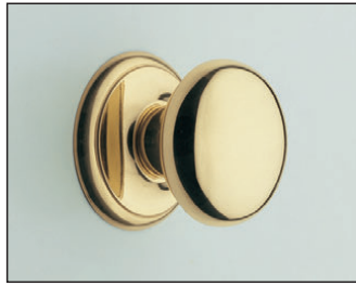
art. 407 \varnothing 70