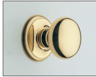
art. 408 \varnothing 70