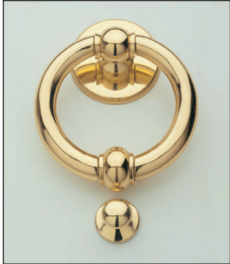
art. 405 \varnothing max 135