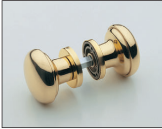
\varnothing 60 art. 400 couple of revolving knobs