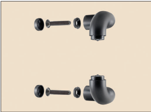
art. 352/S 2 curves + 2 screws to make a bar handle (through screw fixing)