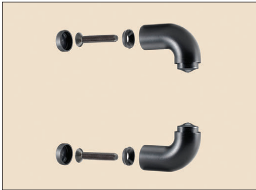
art. 356/S 2 curves + 2 screws to make a bar handle (through screw fixing)