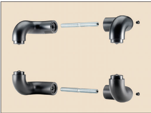
art. 351/S 4 curves + 2 threaded pins to make a couple of bar handles to be fixed opposite (outside and inside the door)