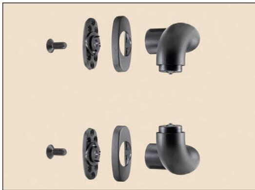
art. 353/S 2 curves + 2 rosettes to make a bar handle (rosette fixing)