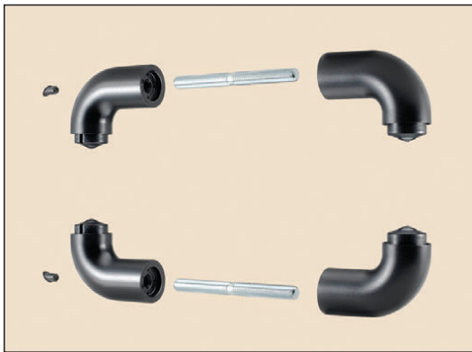
art. 355/S 4 curves + 2 threaded pins to make a couple of bar handles to be fixed opposite (outside and inside the door)