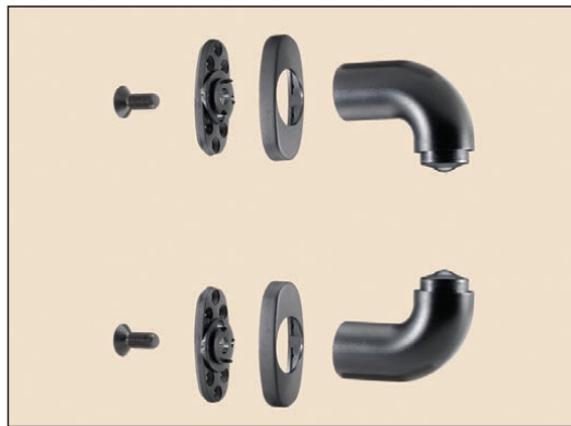
art. 357/S 2 curves + 2 rosettes to make a bar handle (rosette fixing)