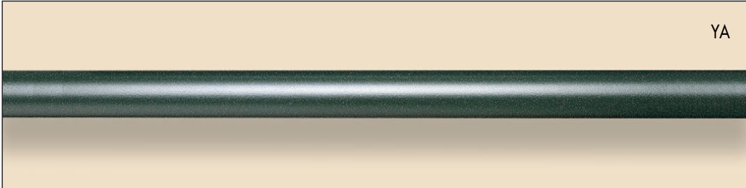
art. 350 length 1 - 2 - 3 meters